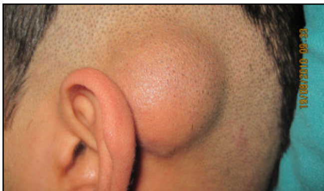
Fig. 1 Patient Presenting with Left Mastoid Region Swelling

their growth has been suggested from time to time including trauma with subsequent ossifying petrositis as suggested by Frieberg et al. (3). Other theories suggested include congenital mechanism 7 and pituitary influence. 6 These tumors are most often found in post- pubertal age and occur mostly in women (3) contrary to our case which was male.